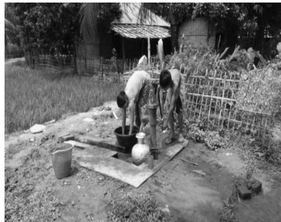
After the project, safe water access