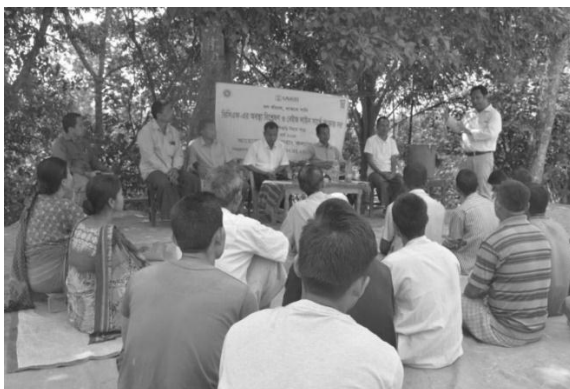
VCF situation analysis & baseline survey meeting, Ultachari Bihar Para