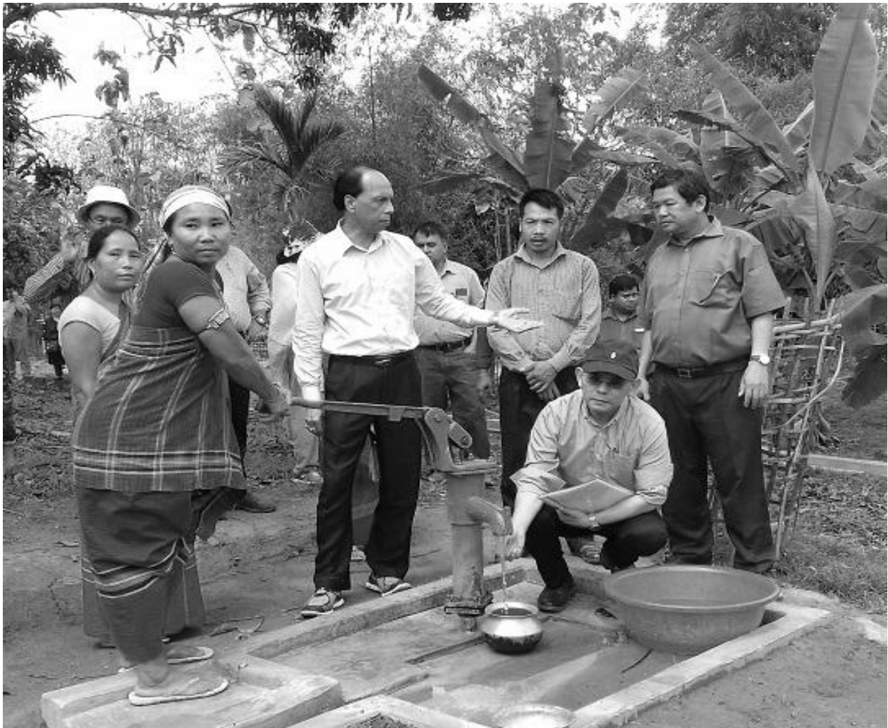
Dewan Para, Laxmichari Upazila: ADB official visit to project activities