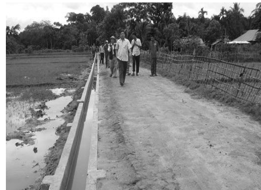
After the project