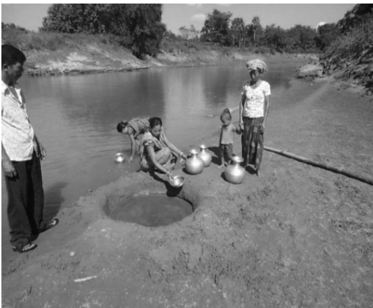
Before the project, safe water access