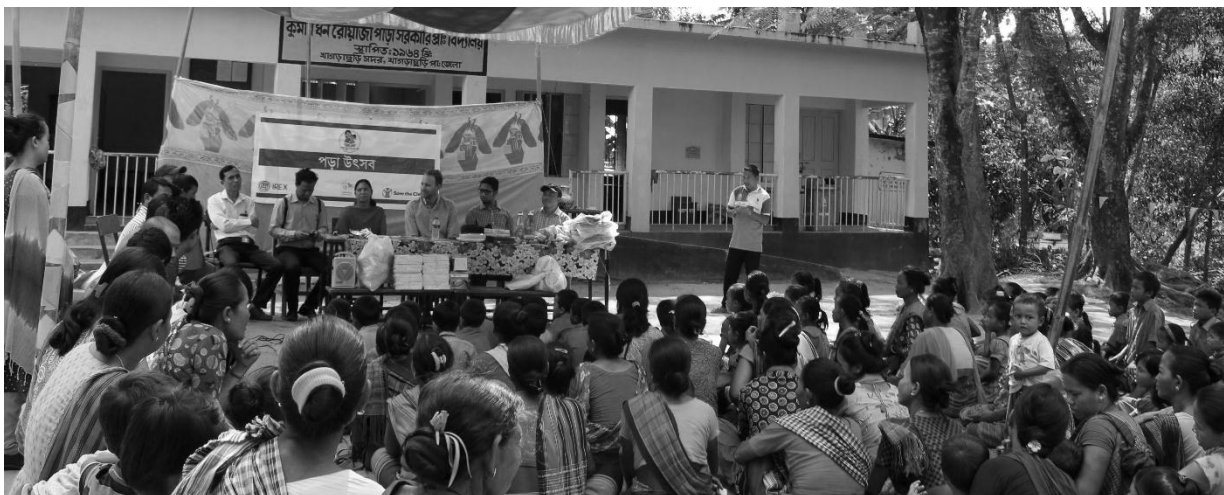
Reading Festival at Kumardan Para Government Primary School, Khagrachhari Sadar