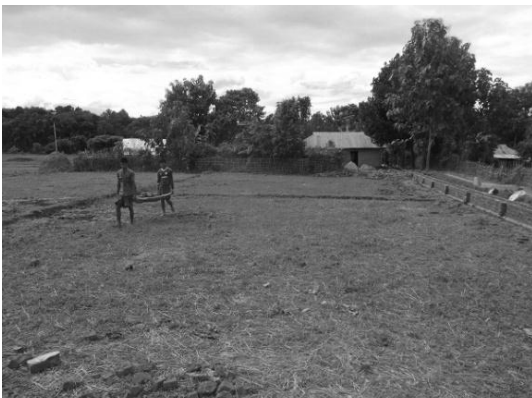
Before the project