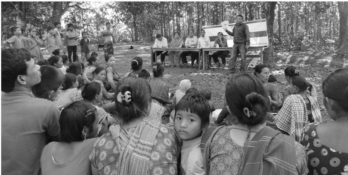
Parent Awareness Session on bloom books, Chappa Para, Dighinala