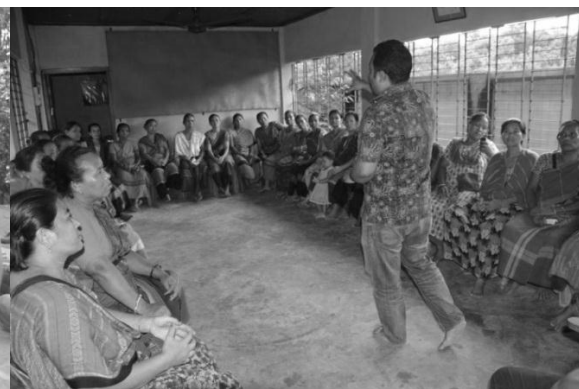
Training for women on adaptation strategy of climate change in Kamalchari, Khagrachhari Sadar